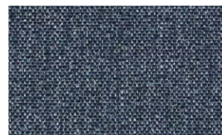
P275 94% Ply 6% Co PR N/A W 140cm