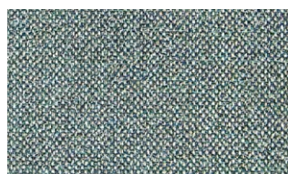
P271 94% Ply 6% Co PR N/A W 140cm