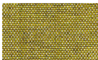
P220 51% Co 49% Ply PR N/A W 140cm