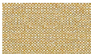
P280 84% Ply 11% Co 5% Vi PR N/A W 140cm