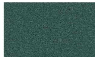
P283 100% Ply PR N/A W 140cm