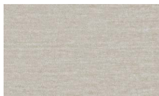
P282 100% Ply PR N/A W 140cm