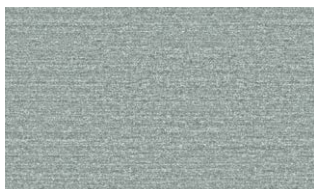
P285 100% Ply PR N/A W 140cm