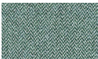
P277 97% Ply 3% Co PR N/A W 140cm