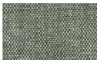
P222 51% Co 49% Ply PR N/A W 140cm