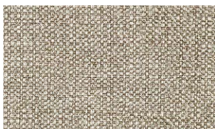
P281 84% Ply 11% Co 5% Vi PR N/A W 140cm