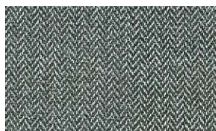
P278 97% Ply 3% Co PR N/A W 140cm