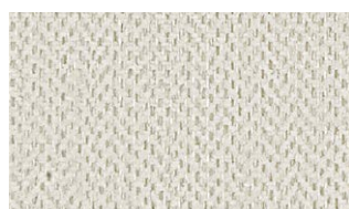
P276 97% Ply 3% Co PR N/A W 140cm