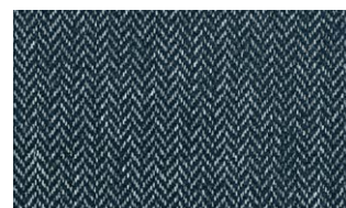
P279 97% Ply 3% Co PR N/A W 140cm