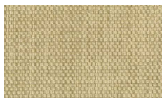
P214 51% Ply 49% Co PR N/A W 140cm