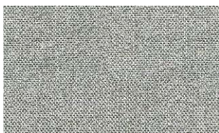
P273 94% Ply 6% Co PR N/A W 140cm