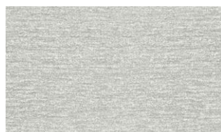
P284 100% Ply PR N/A W 140cm