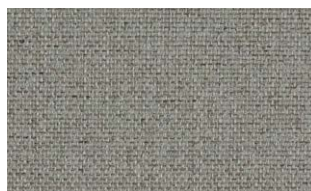
P274 94% Ply 6% Co PR N/A W 140cm